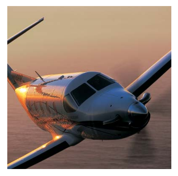
Take the uncertainty out of maintenance costs. A fixed-price MPP contract guarantees that your repair bills won't exceed your budget.

Your environmental and cabin pressure control systems are a big investment...an investment worth protecting. Designed for business aviation, the Mechanical Protection Program (MPP) is a maintenance service program for these systems—because the unexpected can happen. So avoid unplanned maintenance costs. Avoid downtime. Avoid unnecessary stress. After all, when it comes to your aircraft, time is money.